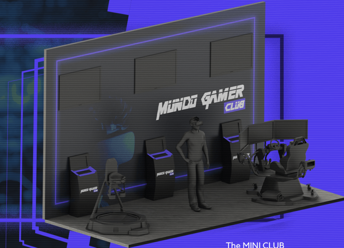
The MINI CLUB

A place with the latest releases of games and consoles, Hi-end PC, Virtual Reality Stations, Music Stations, Racing Simulators, a pub with excellent snacks, foods and drinks, big-screen streaming championships, and a Shop where partners can sell their products.